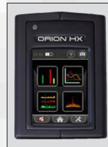
Main screen offers quick mode selection.

MODEL INFORMATION: The transmit power of the ORION 900 HX is 1.4 W EIRP and automatically searches for quiet operating frequencies between 840 and 960 MHz. It is FCC and IC compliant. The G model , with 3.2 W EIRP transmit power, is available to entities, agencies, and persons not restricted by FCC and IC. Both models are CE marked for public safety and security. Commercial CE version also available.