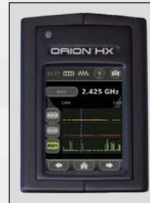
Frequency adjust screen displays transmit, 2nd, and 3rd frequency ranges.