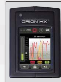
Histogram graph displays history of harmonic response and power adjustment from 10 - 60 second duration.