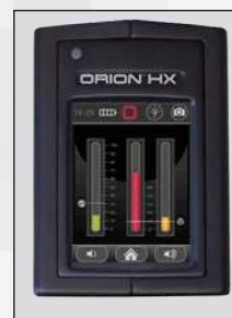
Tx and Rx graph displays transmit power, 2nd, and 3rd harmonic levels and touch screen trip and power level adjustments.