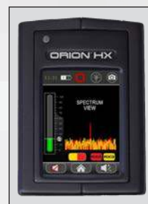
Spectrum View shows 2nd and 3rd harmonic spectrum graphs in several view options